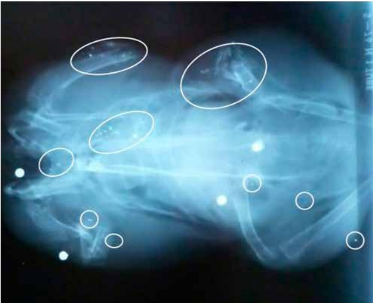
X-ray of a wood pigeon Columba palumbus sold by a game dealer: note the tiny radio-dense lead particles which would go unnoticed by the consumer.

ZIA MH, CODLING EE, SCHECKEL KG, CHANEY RL (2011). In vitro and in vivo approaches for the measurement of oral bioavailability of lead (Pb) in contaminated soils: a review. Environmental Pollution 159(10), 2320-2327.